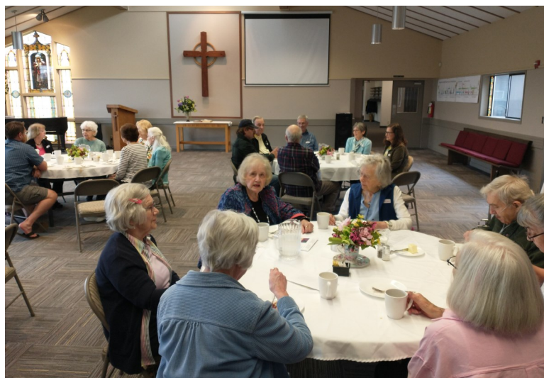
Shepherds End of Year Lunch