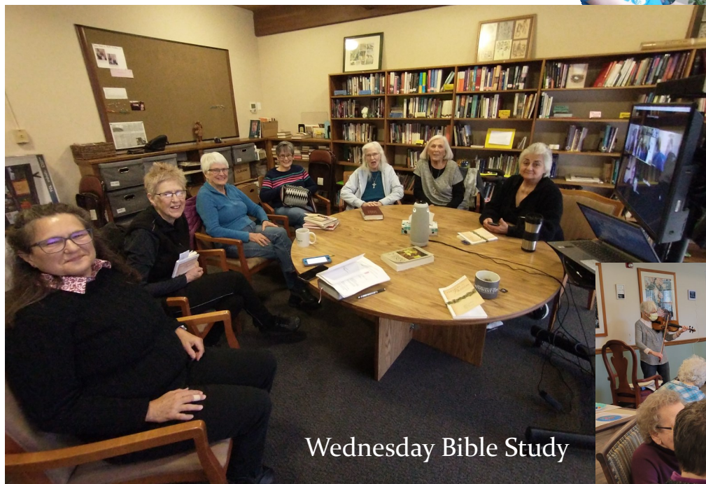
Wednesday Bible Study