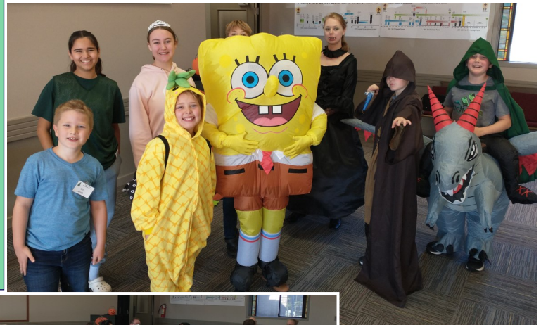
Pumpkin Party 2023