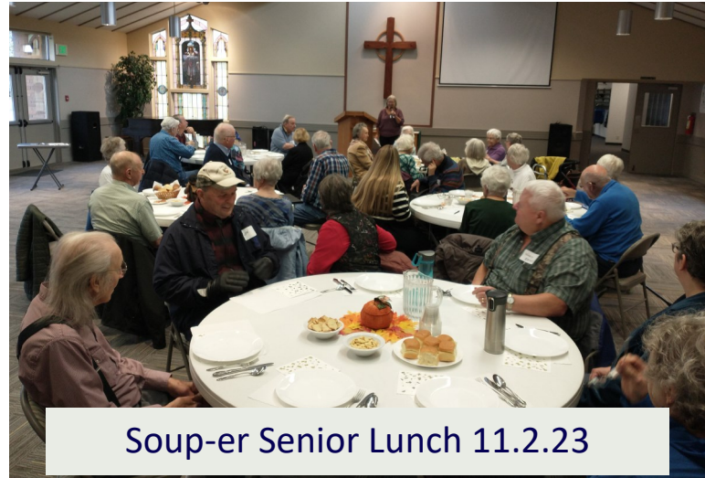
Soup-er Senior Lunch 11.2.23