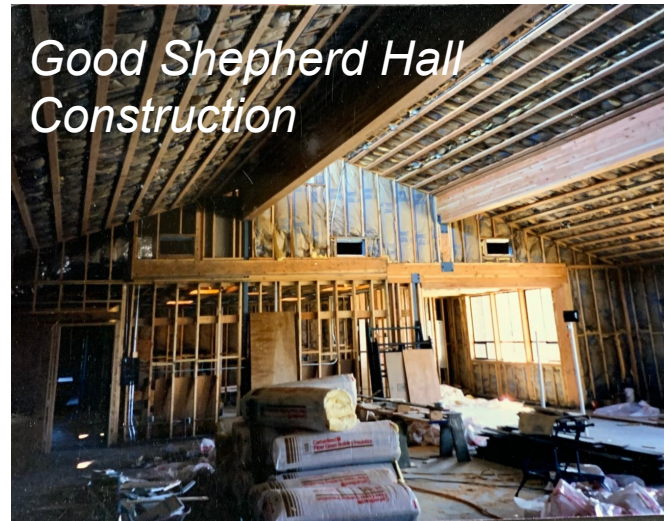
Good Shepherd Hall Construction