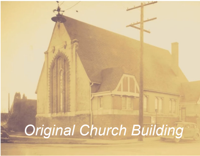
Original Church Building

In April 1902, 12 men and women led by the Holy Spirit, organized the United Presbyterian Church of Mount Vernon. Worship was shared in the Free Methodist Church until 1923 when a brand new structure was dedicated. Christian education was a key focal point with classes for children and adults in various parts of the building. The Ladies Missionary Society was formed in 1907 and held a Thursday morning Bible Study, a Mother-Daughter Banquet each May and an Advent Dinner in December. The women made crib quilts, layette items, summer outfits and more, for those less fortunate. They even saved cancelled stamps for world food needs.