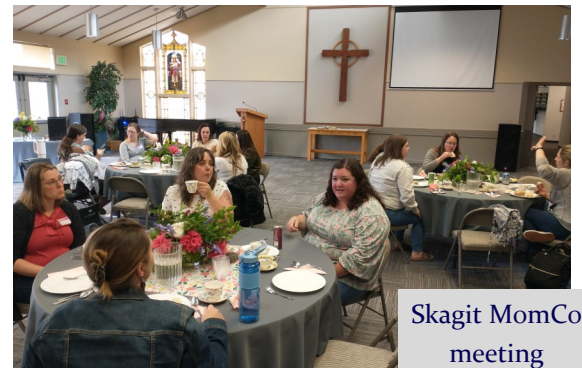
Skagit MomCo meeting