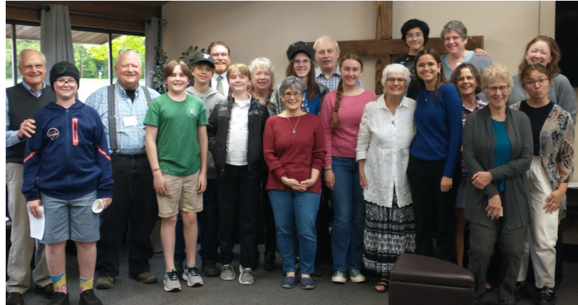
Confirmands and Mentors