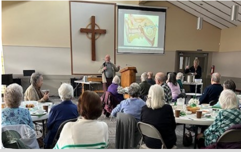
Soup-er Senior Lunch