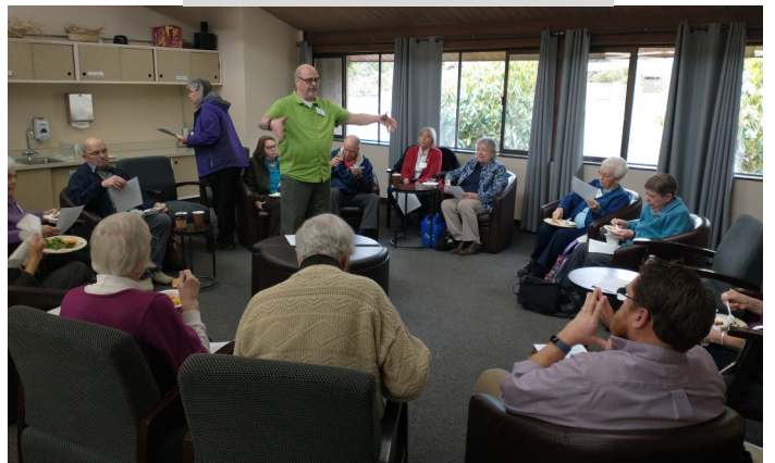
Deacon Connector Training